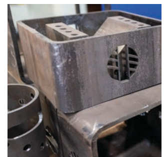
Capable of cutting simple holes to intricate patterns and designs