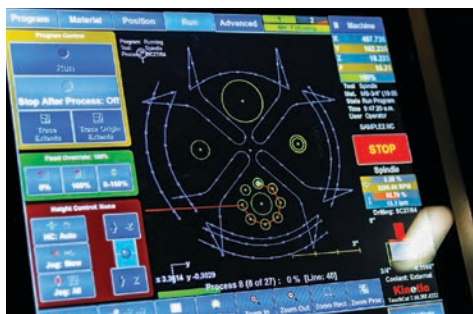
19" LCD touch-screen to accurately monitor multi-step, multi-tool processing for your job