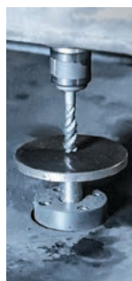
Fast, accurate calibration for tool changes