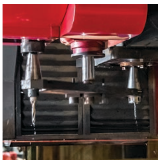
Quick 2-second spindle tool change for less downtime than manual processing