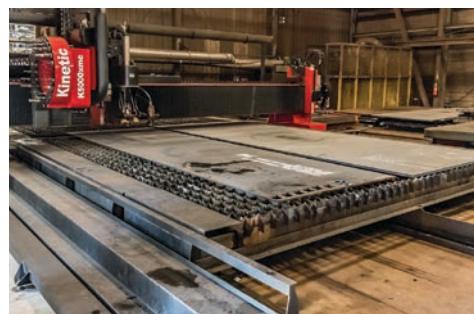
Expansive 16' x 40' cutting table allows small parts to be processed side-by-side, or large orders to be cut within full plate size